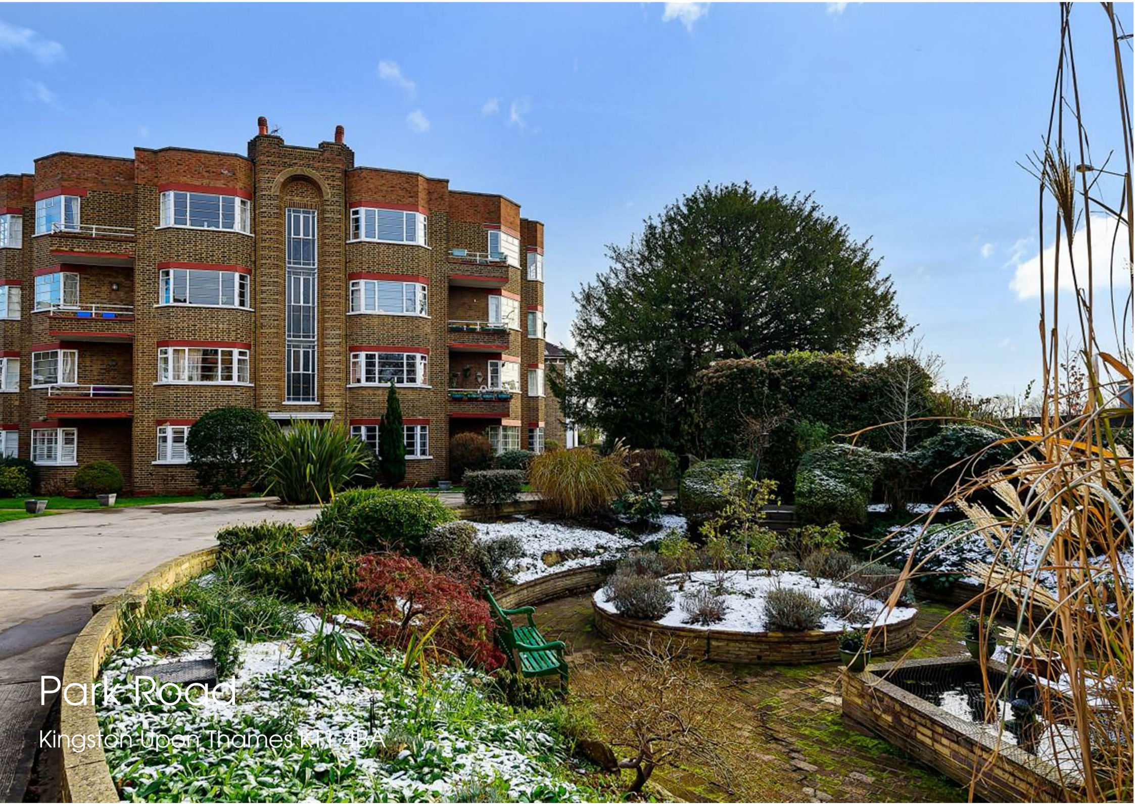
Park Road Kingston upon Thames KT1 4BA

34 Richmond Road Kingston upon Thames Surrey KT2 5ED www.gibsonlane.co.uk Tel: 020 8546 5444